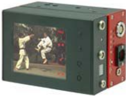
TRI-VIT with optional Display/control unit