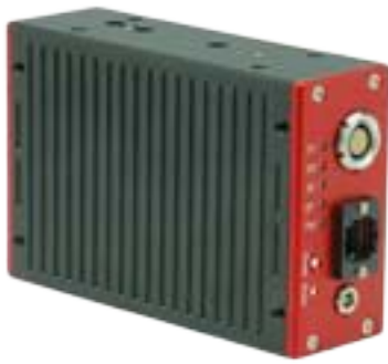
The TRI-VIT backplate is flat for easy installation - all connectors, buttons and LEDs at the side