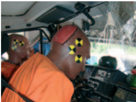
Car crash (on board)